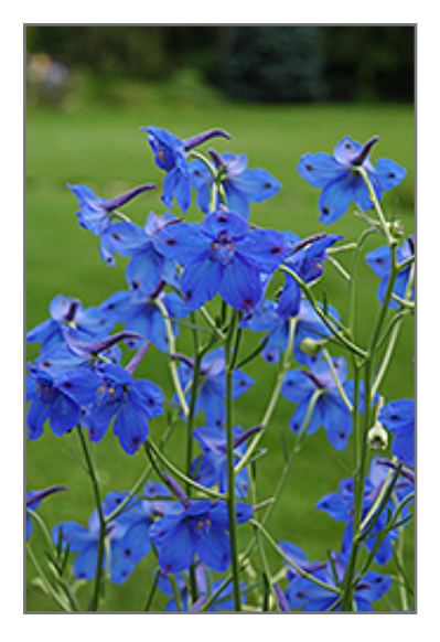
Chinese Delphinium flowers

This plant will require occasional maintenance and upkeep, and should be cut back in late fall in preparation for winter. It is a good choice for attracting bees, butterflies and hummingbirds to your yard. Gardeners should be aware of the following characteristic(s) that may warrant special consideration;