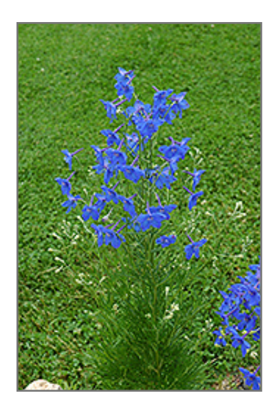
Chinese Delphinium flowers