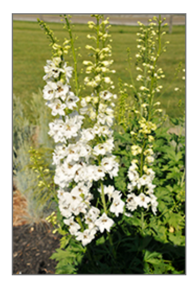
Pacific Giant Galahad Larkspur flowers