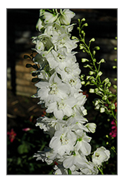
Pacific Giant Galahad Larkspur flowers