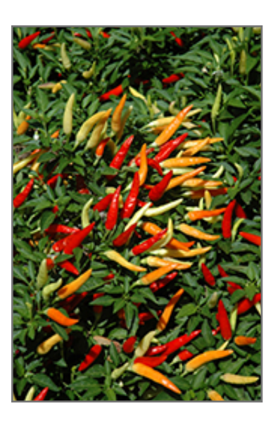
Basket Of Fire Ornamental Pepper fruit

Basket Of Fire Ornamental Pepper's attractive pointy leaves remain green in colour throughout the year on a plant with an upright spreading habit of growth. It features subtle white star-shaped flowers dangling from the stems from late spring to mid summer. The orange narrow fruit is edible and has a spicy taste and a crisp texture. Note that in general, it can be difficult to get plants to reliably produce fruit indoors; this may be a challenge best reserved for adventurous and experienced gardeners.