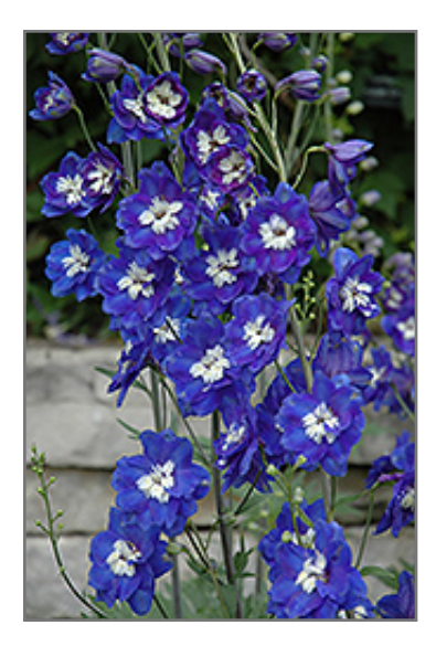
Pacific Giant Blue Bird Larkspur flowers