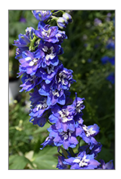
Pacific Giant Blue Bird Larkspur flowers