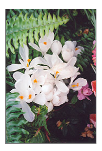
Jeanne D'Arc Crocus flowers