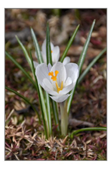
Jeanne D'Arc Crocus flowers