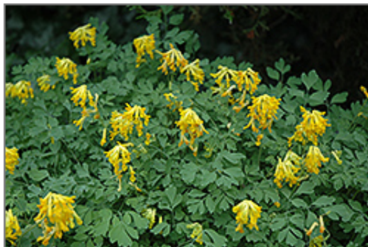
Golden Corydalis in bloom