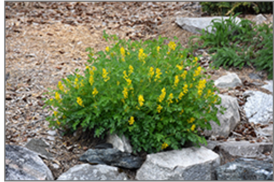
Golden Corydalis in bloom

This plant does best in partial shade to shade. It prefers to grow in average to moist conditions, and shouldn't be allowed to dry out. It is not particular as to soil type or pH. It is quite intolerant of urban pollution, therefore inner city or urban streetside plantings are best avoided, and will benefit from being planted in a relatively sheltered location. Consider applying a thick mulch around the root zone in winter to protect it in exposed locations or colder microclimates. This species is not originally from North America.