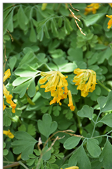
Golden Corydalis flowers