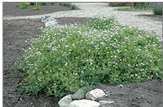
Crown Vetch in bloom