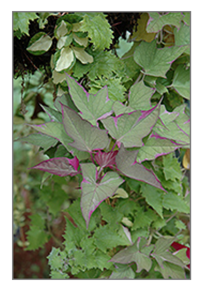
Tricolor Sweet Potato Vine foliage

This is a dense herbaceous houseplant with a trailing habit of growth, eventually spilling over the edges of hanging baskets and containers. This plant may benefit from an occasional pruning to look its best.