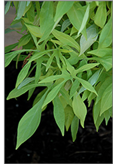
Illusion Emerald Lace Sweet Potato Vine foliage

There are many factors that will affect the ultimate height, spread and overall performance of a plant when grown indoors; among them, the size of the pot it's growing in, the amount of light it receives, watering frequency, the pruning regimen and repotting schedule. Use the information described here as a guideline only; individual performance can and will vary. Please contact the store to speak with one of our experts if you are interested in further details concerning recommendations on pot size, watering, pruning, repotting, etc.