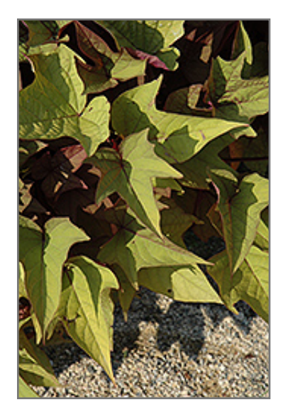
Bright Ideas Rusty Red Sweet Potato Vine foliage

When grown indoors, Bright Ideas Rusty Red Sweet Potato Vine can be expected to grow to be about 12 inches tall at maturity, with a spread of 24 inches. It grows at a fast rate, and under ideal conditions can be expected to live for approximately 1 years. This houseplant will do well in a location that gets either direct or indirect sunlight, although it will usually require a more brightly-lit environment than what artificial indoor lighting alone can provide. It does best in average to evenly moist soil, but will not tolerate standing water. The surface of the soil shouldn't be allowed to dry out completely, and so you should expect to water this plant once and possibly even twice each week. Be aware that your particular watering schedule may vary depending on its location in the room, the pot size, plant size and other conditions; if in doubt, ask one of our experts in the store for advice. It is not particular as to soil type or pH; an average potting soil should work just fine.