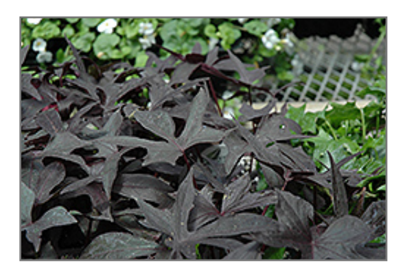
Proven Accents Blackie Sweet Potato Vine foliage

When grown indoors, Proven Accents Blackie Sweet Potato Vine can be expected to grow to be about 10 inches tall at maturity, with a spread of 6 feet. It grows at a fast rate, and under ideal conditions can be expected to live for approximately 1 years. This houseplant will do well in a location that gets either direct or indirect sunlight, although it will usually require a more brightly-lit environment than what artificial indoor lighting alone can provide. It does best in average to evenly moist soil, but will not tolerate standing water. The surface of the soil shouldn't be allowed to dry out completely, and so you should expect to water this plant once and possibly even twice each week. Be aware that your particular watering schedule may vary depending on its location in the room, the pot size, plant size and other conditions; if in doubt, ask one of our experts in the store for advice. It does not require much in the way of fertilizing once established. It is not particular as to soil type or pH; an average potting soil should work just fine.