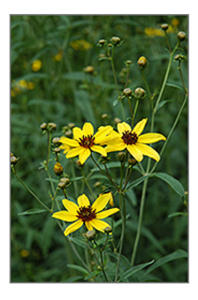
Tall Tickseed flowers

Tall Tickseed has masses of beautiful yellow daisy flowers with dark brown eyes at the ends of the stems from mid summer to early fall, which are most effective when planted in groupings. The flowers are excellent for cutting. Its fragrant ferny leaves remain forest green in colour throughout the season.