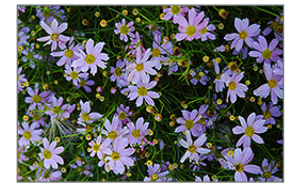
Pink Tickseed flowers