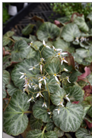
Creeping Saxifrage flowers