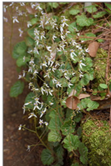
Creeping Saxifrage in bloom

This is an herbaceous evergreen houseplant with a spreading, ground-hugging habit of growth. Its relatively fine texture sets it apart from other indoor plants with less refined foliage. This plant should not require much pruning, except when necessary to keep it looking its best.