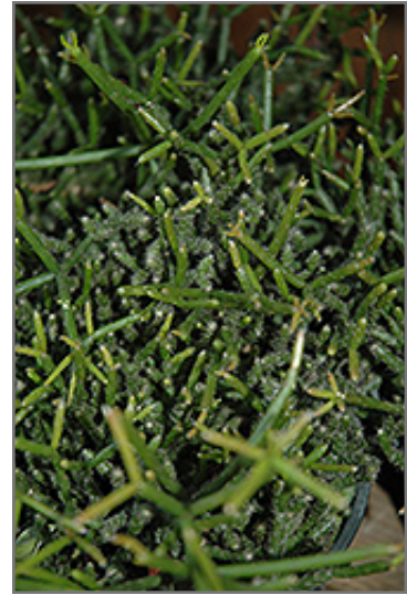
Hairy Stemmed Rhipsalis foliage

When grown indoors, Hairy Stemmed Rhipsalis can be expected to grow to be about 16 inches tall at maturity, with a spread of 24 inches. It grows at a slow rate, and under ideal conditions can be expected to live for approximately 30 years. This houseplant performs well in both bright or indirect sunlight and strong artificial light, and can therefore be situated in almost any well-lit room or location. This is a unique plant in that it requires extremely dry, well-drained soil, and it will die if left in standing water for any length of time - in fact it will suffer if it is over-watered. The soil should be allowed to go completely dry to the touch an inch or two deep for prolonged periods, and it may only need watering once every few weeks. Be aware that your particular watering schedule may vary depending on its location in the room, the pot size, plant size and other conditions; if in doubt, ask one of our experts in the store for advice. Like most succulents and cacti, it prefers to grow in poor soils and should therefore never be fertilized. It is not particular as to soil type or pH; an average potting soil should work just fine.