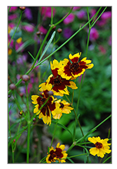
Brown Eyes Tickseed flowers