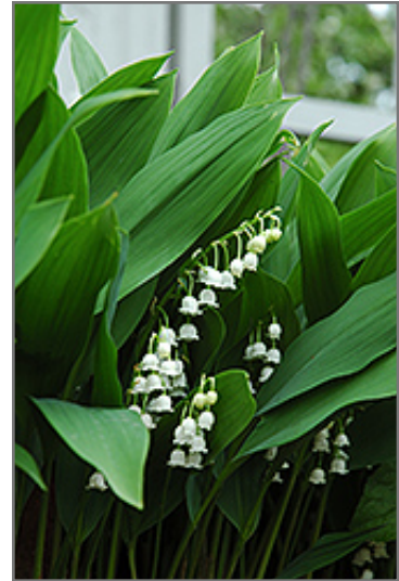
Lily-Of-The-Valley flowers