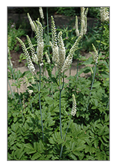
American Bugbane in bloom

From shaded areas to full sun, fragrant white, bottle brush flowers rise high above lacy, green foliage; blooming mid to late summer, great for mixed containers, garden beds or fresh-cut arrangements; easy to grow and can be cut back in fall