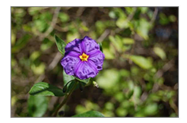
Blue Potato Bush (tree form) flowers