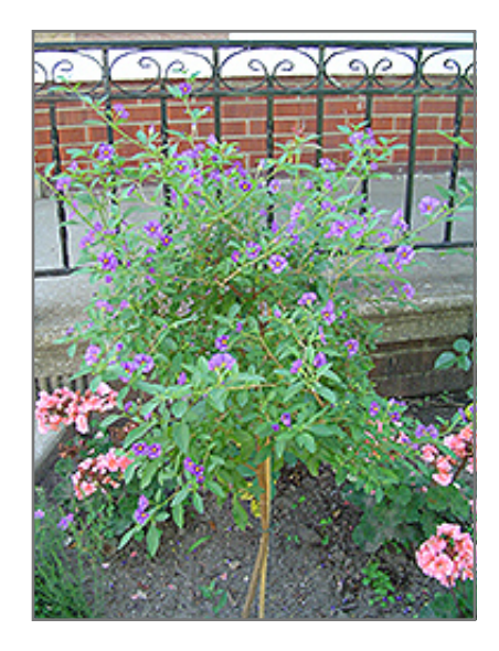
Blue Potato Bush (tree form) in bloom

This is an evergreen houseplant with a strong central leader and an upright spreading habit of growth. This plant may benefit from an occasional pruning to look its best.