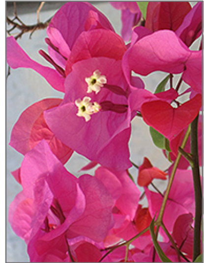
James Walker Bougainvillea flowers

This is a multi-stemmed evergreen houseplant with a spreading, ground-hugging habit of growth. This plant can be pruned at any time to keep it looking its best.