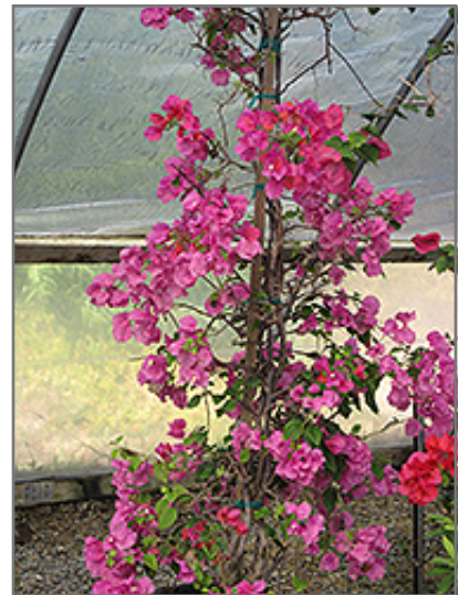
James Walker Bougainvillea in bloom