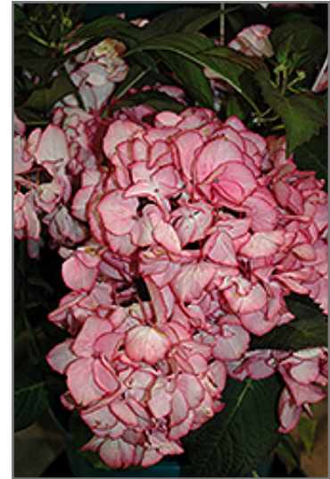
Sweet 'N Salsa Hydrangea flowers

When grown indoors, Sweet 'N Salsa Hydrangea can be expected to grow to be about 3 feet tall at maturity, with a spread of 3 feet. It grows at a fast rate, and under ideal conditions can be expected to live for approximately 20 years. This houseplant performs well in both bright or indirect sunlight and strong artificial light, and can therefore be situated in almost any well-lit room or location. It requires an evenly moist well-drained soil for optimal growth. The surface of the soil shouldn't be allowed to dry out completely, and so you should expect to water this plant once and possibly even twice each week. Be aware that your particular watering schedule may vary depending on its location in the room, the pot size, plant size and other conditions; if in doubt, ask one of our experts in the store for advice. It is not particular as to soil type or pH; an average potting soil should work just fine.