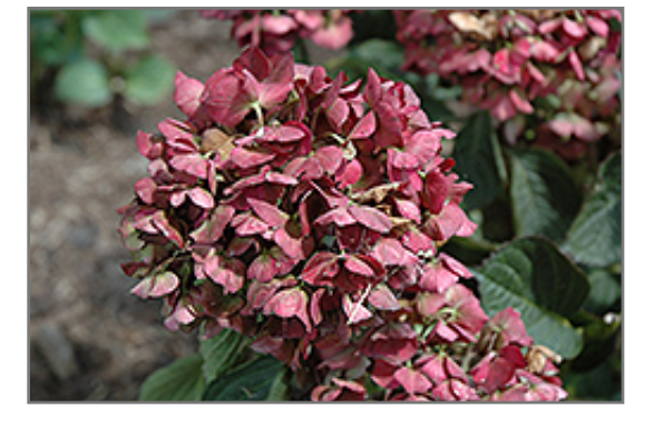
Magical Ruby Red Hydrangea flowers

Magical Ruby Red Hydrangea features showy clusters of ruby-red flowers at the ends of the branches from late spring to early fall. The flowers are excellent for cutting. Its serrated oval leaves remain forest green in colour throughout the year.