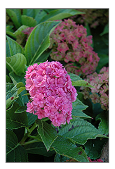
Forever And Ever Together Hydrangea flowers

Incredible double-flowering variety with pink or blue mophead flowers (depending on soil acidity) that progress through a series of colors over the season; plants bloom on both new and old wood for a prolonged flowering season