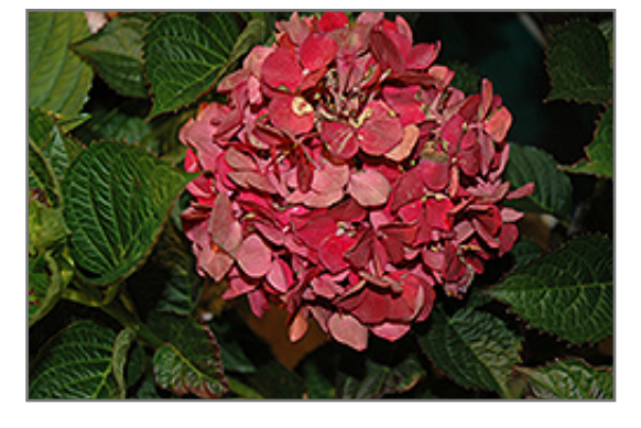
Electric Rouge Hydrangea flowers

Electric Rouge Hydrangea features bold balls of red flowers with pink overtones at the ends of the branches from early summer to early fall. The flowers are excellent for cutting. Its glossy pointy leaves remain forest green in colour throughout the year.