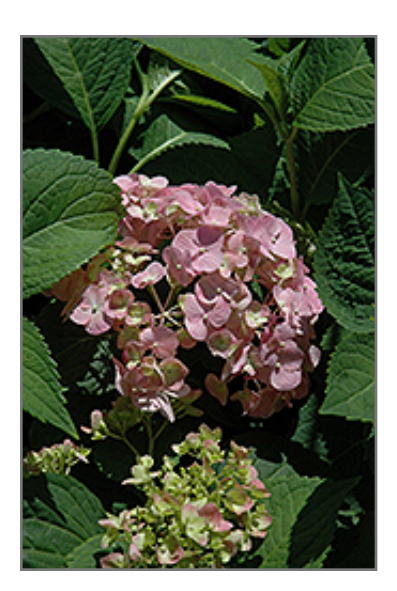
Bountiful Bouquets Hydrangea flowers

When grown indoors, Bountiful Bouquets Hydrangea can be expected to grow to be about 3 feet tall at maturity, with a spread of 3 feet. It grows at a fast rate, and under ideal conditions can be expected to live for approximately 20 years. This houseplant should be situated in a location that that gets indirect sunlight at most, although it will usually require a more brightly-lit environment than what artificial indoor lighting alone can provide. It requires an evenly moist well-drained soil for optimal growth. The surface of the soil shouldn't be allowed to dry out completely, and so you should expect to water this plant once and possibly even twice each week. Be aware that your particular watering schedule may vary depending on its location in the room, the pot size, plant size and other conditions; if in doubt, ask one of our experts in the store for advice. It is not particular as to soil type, but has a definite preference for acidic soil. Contact the store for specific recommendations on pre-mixed potting soil for this plant.