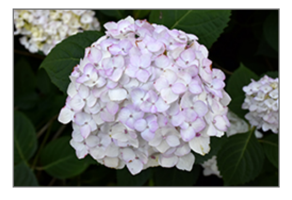
Blushing Bride Hydrangea flowers

Blushing Bride Hydrangea features bold balls of semi-double white flowers with shell pink overtones at the ends of the branches from early summer to mid fall. The flowers are excellent for cutting. Its glossy pointy leaves remain dark green in colour throughout the year.