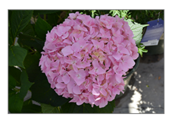
All Summer Beauty Hydrangea flowers

A compact hydrangea that tends to bloom on old wood, resulting in an incredibly long-lasting performance; massive ball-shaped mophead flowers are rich blue in acidic soil, blending into shades of soft pink in more alkaline soils