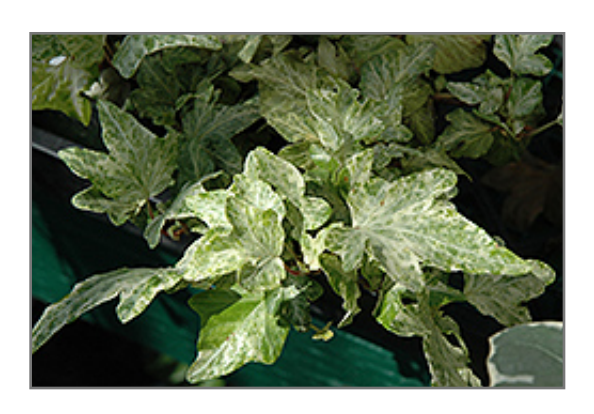
Mystery Ivy foliage

An evergreen climbing vine or dense groundcover with beautiful foliage in shades of green, mottled with creamy white spots; long growing and spreading; many uses for this plant from hanging baskets, walls, to indoor gardening