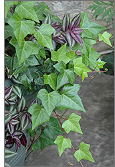
Algerian Ivy foliage

When grown indoors, Algerian Ivy can be expected to grow to be about 10 feet tall at maturity, with a spread of 3 feet. It grows at a fast rate, and under ideal conditions can be expected to live for approximately 30 years. This houseplant performs well in both bright or indirect sunlight and strong artificial light, and can therefore be situated in almost any well-lit room or location. It is very adaptable to both dry and moist soil, and should do just fine under average home conditions. The surface of the soil shouldn't be allowed to dry out completely, and so you should expect to water this plant once and possibly even twice each week. Be aware that your particular watering schedule may vary depending on its location in the room, the pot size, plant size and other conditions; if in doubt, ask one of our experts in the store for advice. It is not particular as to soil pH, but grows best in rich soil. Contact the store for specific recommendations on pre-mixed potting soil for this plant. Be warned that parts of this plant are known to be toxic to humans and animals, so special care should be exercised if growing it around children and pets.