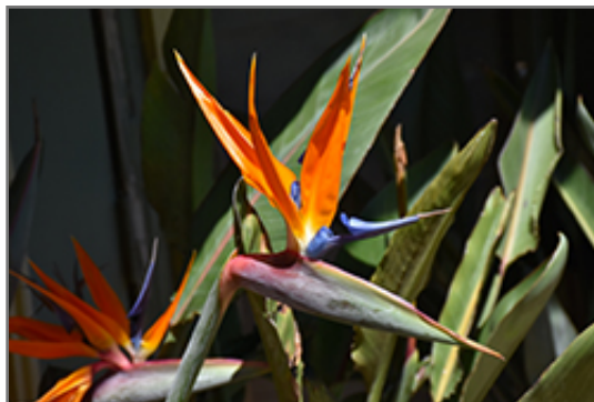
Orange Bird Of Paradise flowers

A beautiful and bold structural plant that forms large clumps of stiff foliage growing up from the base; stunning flowers of orange and blue rise high above the foliage, giving the appearance of a birds head; great cut flower