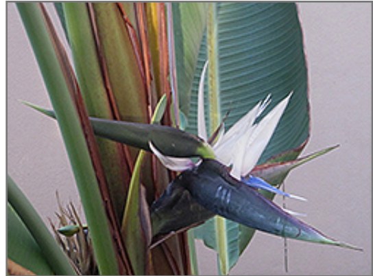
White Bird Of Paradise flowers

This is a multi-stemmed evergreen houseplant with an upright spreading habit of growth. Its wonderfully bold, coarse texture is quite ornamental and should be used to full effect. You may trim off the flower heads after they fade and die to encourage repeat blooming.