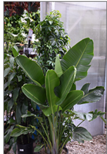
White Bird Of Paradise