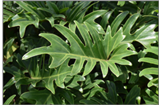
Xanadu Philodendron foliage

When grown indoors, Xanadu Philodendron can be expected to grow to be about 3 feet tall at maturity, with a spread of 4 feet. It grows at a fast rate, and under ideal conditions can be expected to live for approximately 10 years. This houseplant performs well in both bright or indirect sunlight and strong artificial light, and can therefore be situated in almost any well-lit room or location. It prefers to grow in average to moist soil. The surface of the soil shouldn't be allowed to dry out completely, and so you should expect to water this plant once and possibly even twice each week. Be aware that your particular watering schedule may vary depending on its location in the room, the pot size, plant size and other conditions; if in doubt, ask one of our experts in the store for advice. It is not particular as to soil type or pH; an average potting soil should work just fine. Be warned that parts of this plant are known to be toxic to humans and animals, so special care should be exercised if growing it around children and pets.