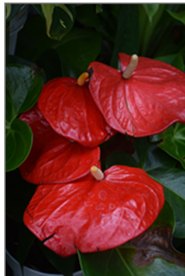
Anthurium flowers

When grown indoors, Anthurium can be expected to grow to be about 18 inches tall at maturity, with a spread of 12 inches. It grows at a medium rate, and under ideal conditions can be expected to live for approximately 5 years. This houseplant performs well in both bright or indirect sunlight and strong artificial light, and can therefore be situated in almost any well-lit room or location. It does best in average to evenly moist soil, but will not tolerate standing water. The surface of the soil shouldn't be allowed to dry out completely, and so you should expect to water this plant once and possibly even twice each week. Be aware that your particular watering schedule may vary depending on its location in the room, the pot size, plant size and other conditions; if in doubt, ask one of our experts in the store for advice. It is not particular as to soil type, but has a definite preference for acidic soil. Contact the store for specific recommendations on pre-mixed potting soil for this plant. Be warned that parts of this plant are known to be toxic to humans and animals, so special care should be exercised if growing it around children and pets.