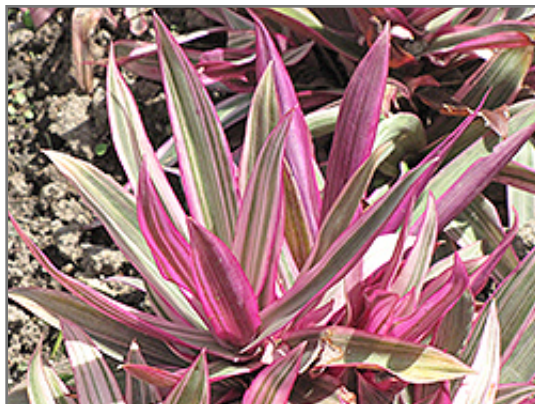
Variegated Moses In The Cradle foliage

When grown indoors, Variegated Moses In The Cradle can be expected to grow to be about 12 inches tall at maturity, with a spread of 24 inches. It grows at a fast rate, and under ideal conditions can be expected to live for approximately 10 years. This houseplant will do well in a location that gets either direct or indirect sunlight, although it will usually require a more brightly-lit environment than what artificial indoor lighting alone can provide. It prefers to grow in average to moist soil. The surface of the soil shouldn't be allowed to dry out completely, and so you should expect to water this plant once and possibly even twice each week. Be aware that your particular watering schedule may vary depending on its location in the room, the pot size, plant size and other conditions; if in doubt, ask one of our experts in the store for advice. It is not particular as to soil type or pH; an average potting soil should work just fine.