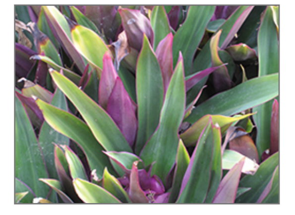
Moses In The Cradle foliage

Moses In The Cradle features showy cymes of white flowers with purple bracts at the ends of the stems from early spring to late winter. Its sword-like leaves remain dark green in colour with curious purple undersides throughout the year.