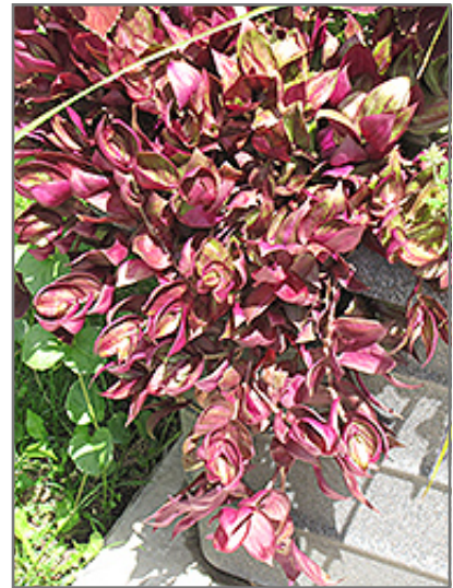
Purple Wandering Jew

When grown indoors, Purple Wandering Jew can be expected to grow to be about 14 inches tall at maturity, with a spread of 14 inches. It grows at a fast rate, and under ideal conditions can be expected to live for approximately 10 years. This houseplant performs well in both bright or indirect sunlight and strong artificial light, and can therefore be situated in almost any well-lit room or location. It prefers to grow in average to moist soil. The surface of the soil shouldn't be allowed to dry out completely, and so you should expect to water this plant once and possibly even twice each week. Be aware that your particular watering schedule may vary depending on its location in the room, the pot size, plant size and other conditions; if in doubt, ask one of our experts in the store for advice. It is not particular as to soil type or pH; an average potting soil should work just fine.