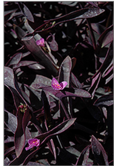
Purple Queen flowers

When grown indoors, Purple Queen can be expected to grow to be about 14 inches tall at maturity, with a spread of 24 inches. It grows at a fast rate, and under ideal conditions can be expected to live for approximately 10 years. This houseplant performs well in both bright or indirect sunlight and strong artificial light, and can therefore be situated in almost any well-lit room or location. It prefers to grow in average to moist soil. The surface of the soil shouldn't be allowed to dry out completely, and so you should expect to water this plant once and possibly even twice each week. Be aware that your particular watering schedule may vary depending on its location in the room, the pot size, plant size and other conditions; if in doubt, ask one of our experts in the store for advice. It is not particular as to soil type or pH; an average potting soil should work just fine.