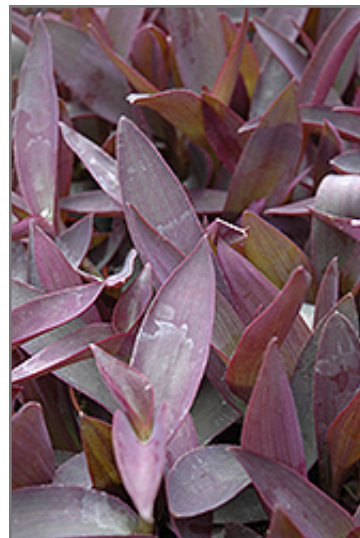
Purple Heart foliage

When grown indoors, Purple Heart can be expected to grow to be about 14 inches tall at maturity, with a spread of 24 inches. It grows at a fast rate, and under ideal conditions can be expected to live for approximately 10 years. This houseplant performs well in both bright or indirect sunlight and strong artificial light, and can therefore be situated in almost any well-lit room or location. It prefers to grow in average to moist soil. The surface of the soil shouldn't be allowed to dry out completely, and so you should expect to water this plant once and possibly even twice each week. Be aware that your particular watering schedule may vary depending on its location in the room, the pot size, plant size and other conditions; if in doubt, ask one of our experts in the store for advice. It is not particular as to soil type or pH; an average potting soil should work just fine.