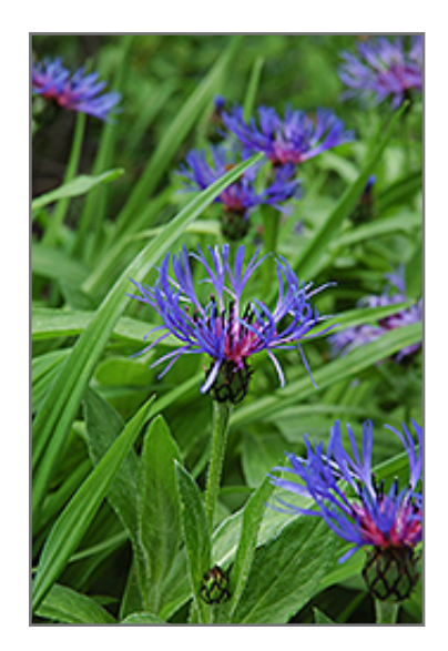
Mountain Bluet flowers