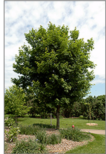
Sugar Maple

This tree should only be grown in full sunlight. It prefers to grow in average to moist conditions, and shouldn't be allowed to dry out. It is not particular as to soil pH, but grows best in rich soils. It is somewhat tolerant of urban pollution. This species is native to parts of North America.