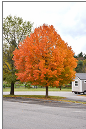
Sugar Maple in fall