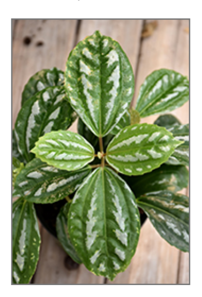
Aluminum Plant in full