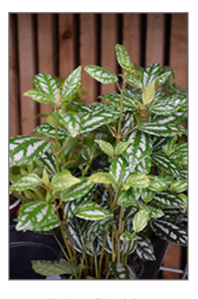
Aluminum Plant foliage

This is a dense herbaceous evergreen houseplant with a mounded form. Its relatively fine texture sets it apart from other indoor plants with less refined foliage. This plant may benefit from an occasional pruning to look its best.