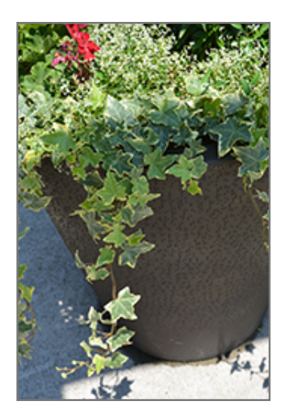
Yellow Ripple Ivy