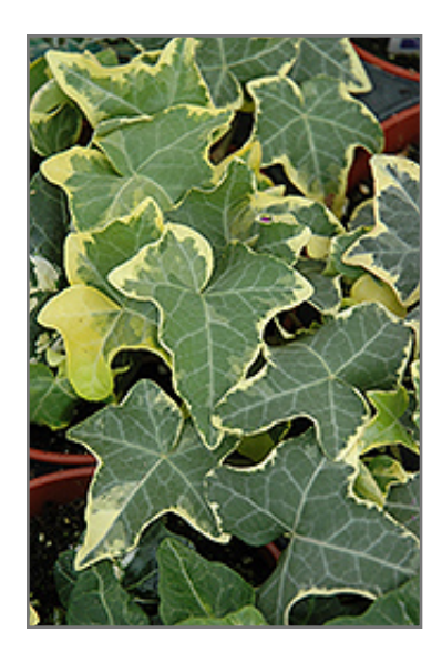
Yellow Ripple Ivy foliage

This is a multi-stemmed evergreen houseplant with a spreading, ground-hugging habit of growth. This plant can be pruned at any time to keep it looking its best.