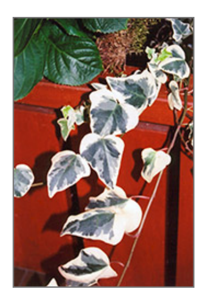
Variegated English Ivy foliage

When grown indoors, Variegated English Ivy can be expected to grow to be about 8 inches tall at maturity, with a spread of 10 feet. It grows at a medium rate, and under ideal conditions can be expected to live for approximately 30 years. This houseplant performs well in both bright or indirect sunlight and strong artificial light, and can therefore be situated in almost any well-lit room or location. It prefers to grow in average to moist soil. The surface of the soil shouldn't be allowed to dry out completely, and so you should expect to water this plant once and possibly even twice each week. Be aware that your particular watering schedule may vary depending on its location in the room, the pot size, plant size and other conditions; if in doubt, ask one of our experts in the store for advice. It is not particular as to soil pH, but grows best in rich soil. Contact the store for specific recommendations on pre-mixed potting soil for this plant. Be warned that parts of this plant are known to be toxic to humans and animals, so special care should be exercised if growing it around children and pets.