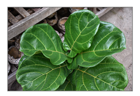
Fiddle Leaf Fig foliage

When grown indoors, Fiddle Leaf Fig can be expected to grow to be about 6 feet tall at maturity, with a spread of 4 feet. It grows at a medium rate, and under ideal conditions can be expected to live for approximately 100 years. This houseplant will do well in a location that gets either direct or indirect sunlight, although it will usually require a more brightly-lit environment than what artificial indoor lighting alone can provide. It does best in average to evenly moist soil, but will not tolerate standing water. The surface of the soil shouldn't be allowed to dry out completely, and so you should expect to water this plant once and possibly even twice each week. Be aware that your particular watering schedule may vary depending on its location in the room, the pot size, plant size and other conditions; if in doubt, ask one of our experts in the store for advice. It is not particular as to soil type, but has a definite preference for acidic soil. Contact the store for specific recommendations on pre-mixed potting soil for this plant. Be warned that parts of this plant are known to be toxic to humans and animals, so special care should be exercised if growing it around children and pets.