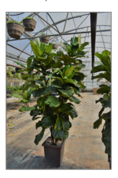
Fiddle Leaf Fig in full