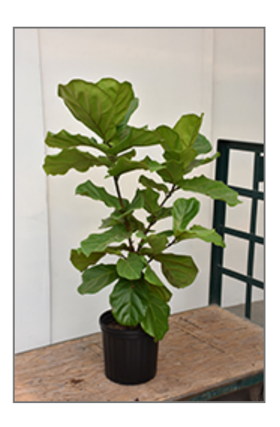
Fiddle Leaf Fig in full

This is a multi-stemmed evergreen houseplant with a shapely oval form. This plant may benefit from an occasional pruning to look its best.