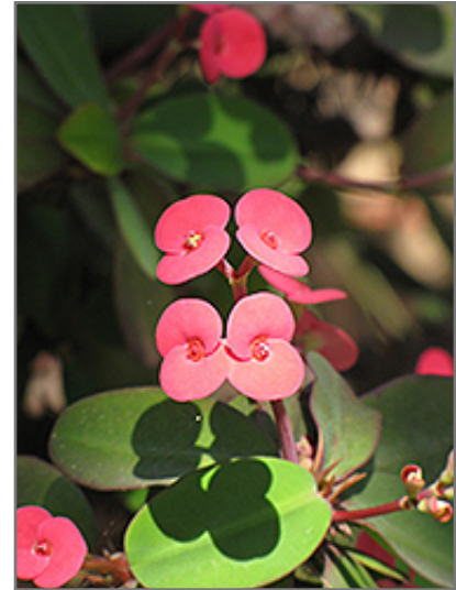
Crown Of Thorns flowers

When grown indoors, Crown Of Thorns can be expected to grow to be about 6 feet tall at maturity, with a spread of 3 feet. It grows at a slow rate, and under ideal conditions can be expected to live for approximately 20 years. This houseplant will do well in a location that gets either direct or indirect sunlight, although it will usually require a more brightly-lit environment than what artificial indoor lighting alone can provide. It prefers dry to average moisture levels with very well-drained soil, and may die if left in standing water for any length of time. This plant should be watered when the surface of the soil gets dry, and will need watering approximately once each week. Be aware that your particular watering schedule may vary depending on its location in the room, the pot size, plant size and other conditions; if in doubt, ask one of our experts in the store for advice. It is not particular as to soil pH, but grows best in sandy soil. Contact the store for specific recommendations on pre-mixed potting soil for this plant. Be warned that parts of this plant are known to be toxic to humans and animals, so special care should be exercised if growing it around children and pets.