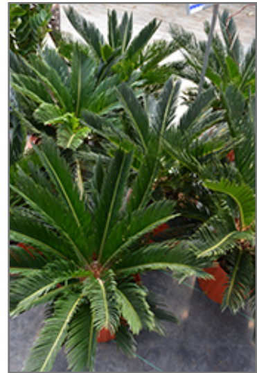
Japanese Sago Palm

This is a multi-stemmed evergreen houseplant with a shapely form and gracefully arching foliage. Its relatively fine texture sets it apart from other indoor plants with less refined foliage. This plant should not require much pruning, except when necessary to keep it looking its best.