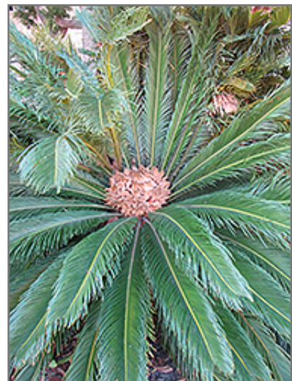
Japanese Sago Palm in bloom