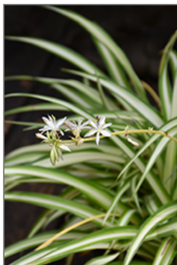
Spider Plant flowers