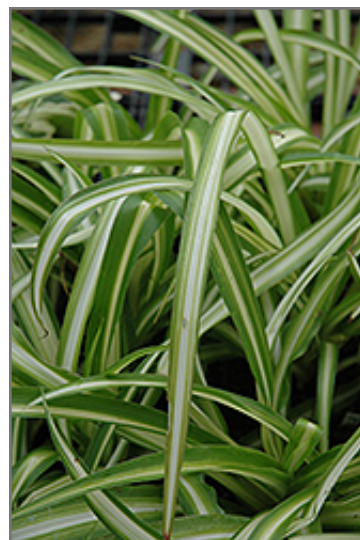
Spider Plant foliage

When grown indoors, Spider Plant can be expected to grow to be about 24 inches tall at maturity, with a spread of 24 inches. It grows at a medium rate, and under ideal conditions can be expected to live for approximately 10 years. This houseplant performs well in both bright or indirect sunlight and strong artificial light, and can therefore be situated in almost any well-lit room or location. It is very adaptable to both dry and moist soil, but will not tolerate any standing water. The surface of the soil shouldn't be allowed to dry out completely, and so you should expect to water this plant once and possibly even twice each week. Be aware that your particular watering schedule may vary depending on its location in the room, the pot size, plant size and other conditions; if in doubt, ask one of our experts in the store for advice. It is not particular as to soil type or pH; an average potting soil should work just fine.