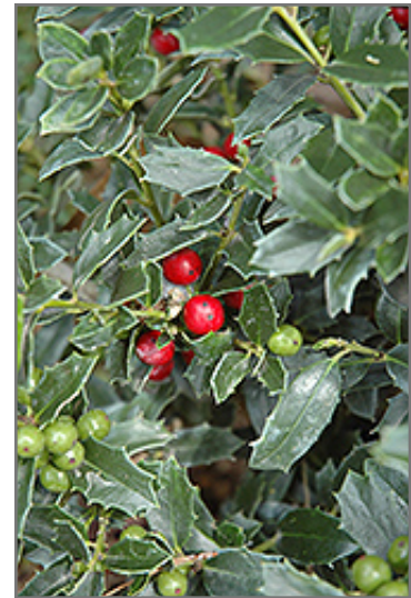
Coral Berry fruit

When grown indoors, Coral Berry can be expected to grow to be about 4 feet tall at maturity, with a spread of 3 feet. It grows at a medium rate, and under ideal conditions can be expected to live for approximately 40 years. This houseplant will do well in a location that gets either direct or indirect sunlight, although it will usually require a more brightly-lit environment than what artificial indoor lighting alone can provide. It does best in average to evenly moist soil, but will not tolerate standing water. The surface of the soil shouldn't be allowed to dry out completely, and so you should expect to water this plant once and possibly even twice each week. Be aware that your particular watering schedule may vary depending on its location in the room, the pot size, plant size and other conditions; if in doubt, ask one of our experts in the store for advice. It is particular about its soil conditions, with a strong preference for rich, acidic soil. Contact the store for specific recommendations on pre-mixed potting soil for this plant.