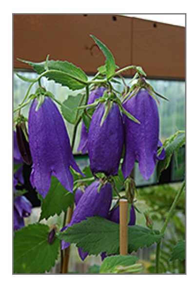
Sarastro Bellflower flowers