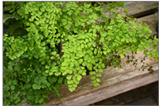
Brittle Maidenhair Fern foliage

When grown indoors, Brittle Maidenhair Fern can be expected to grow to be about 18 inches tall at maturity, with a spread of 24 inches. It grows at a slow rate, and under ideal conditions can be expected to live for approximately 15 years. This houseplant performs well in both bright or indirect sunlight and strong artificial light, and can therefore be situated in almost any well-lit room or location. It prefers to grow in moist to almost wet soil, and will even tolerate some standing water. As such, the surface of the soil should be kept consistently moist to the touch, and you can expect to water this plant two or more times each week, especially if it's growing in a lower-humidity environment. Be aware that your particular watering schedule may vary depending on its location in the room, the pot size, plant size and other conditions; if in doubt, ask one of our experts in the store for advice. It is particular about its soil conditions, with a strong preference for rich, alkaline soil. Contact the store for specific recommendations on pre-mixed potting soil for this plant. Be warned that parts of this plant are known to be toxic to humans and animals, so special care should be exercised if growing it around children and pets.